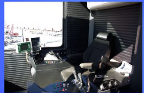
State of the art Hydraulic Control System

Fully Mobile with Individually Powered Crawler Transporters 3,000-ton Capacity Front Crawler Produces Excellent Stability Up to 400' of Lampson Pin-Together Main Boom Two (2) different Jib Styles Available Hydraulic Hoists with Electronic Fingertip Control Ultimate Capacity Exceeding 3000 US Tons Completely Mobile with any Charted Load Easily Transportable by Conventional Trucks Counterweights Use Readily Available Site Aggregate Easily Adaptable to All Lift Situations Call for Complete Capabilities