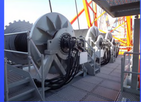
Hydraulic Hoisting Capabilities